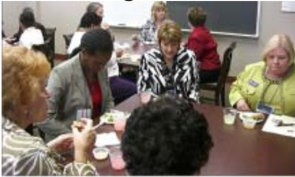
Blessing the Munch and Mingle