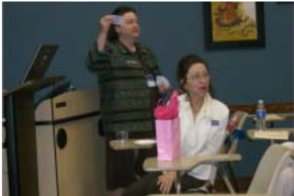
Lots of door prizes - and a "recycleable" means of pulling for them.