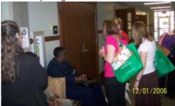
Green ditty bags.